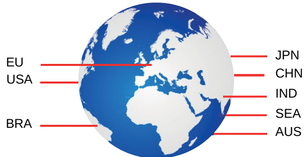
Figure 4 Lowest cost of ownership: make use of the worldwide InstruFiber calibration organisation.