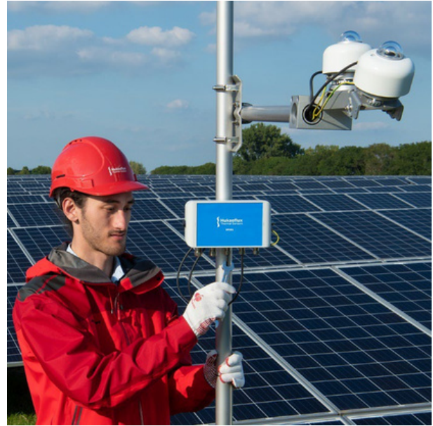
Figure 6 Two SR300-D1 pyranometers that are connected to the SPD01 Surge Protection Device. With the optional SPD01, you can upgrade surge immunity to Level 4.

Are you interested in this product? E-mail us at: contato@instrufiber.com