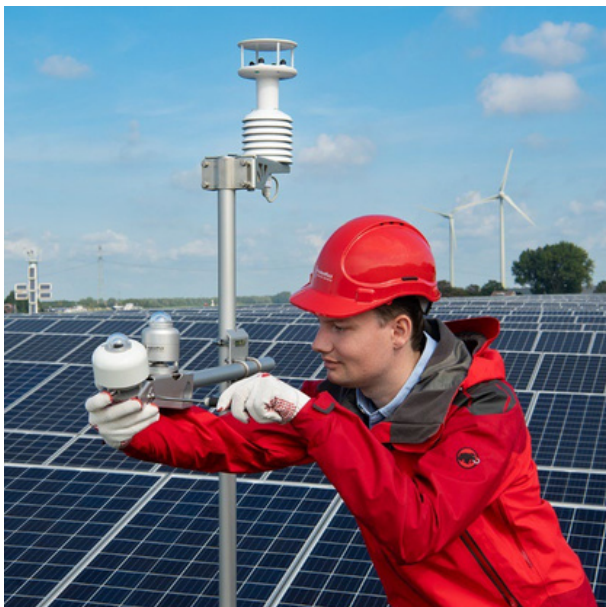
Figure 2 Typical use of pyranometers at PV power plants. The above picture shows two pyranometers, one tilted for Plane of Array (POA) measurement, and another mounted horizontally for Global Horizontal Irradiance (GHI) measurement.

SR300-D1 and SR200-D1 both comply with IEC requirements for "Class A" PV system performance monitoring. SR300-D1 complies for all locations and climatic conditions, SR200 for climates in which dew and frost are not an issue. SR100-D1 complies with requirements for Class B.