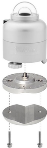
Figure 5 Optional spring-loaded levelling and tube mount for SR300-D1, SR200-D1 and SR100-D1. LM01 levelling mount (one part), TLM01 tube mounted (2 parts). Spring-loaded levelling is a major time-saver during installation.