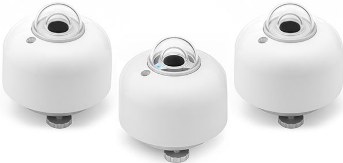
Figure 1 Industrial pyranometer models SR300-D1, SR200-D1 and SR100-D1. In front the leading Class A model SR300-D1, with heating, tilt sensor and the blue status LED. Left and right the non-heated Class A model SR200-D1 and Class B model SR100-D1.